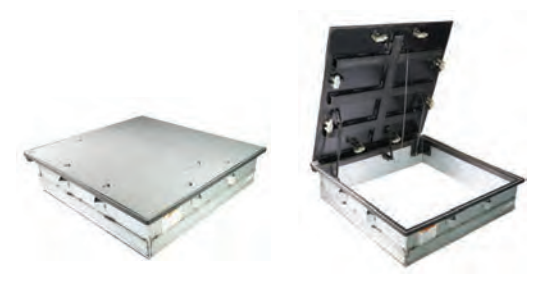
EZ Lift Square Manways

Round units are in stock, and readily available in 30", 36", 42", & 48" diameter. They can be shipped the same day. Square units are built to order and can be manufactured to any size. It takes 5-7 business days to build depending on size and number of doors. An average of 25lbs of lifting force is all that is needed to lift our EZ Lift covers. Only one person is needed. Perfect for emergency calls, one-man crews, general maintenance requiring the cover to be opened frequently.