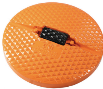
Orange STP200-O ORANGE COLOR SNAP-TIGHT COVER