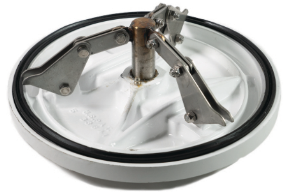
Underside of a Snap Tight Cover