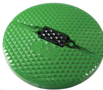
Green STP200-G GREEN COLOR SNAP-TIGHT COVER