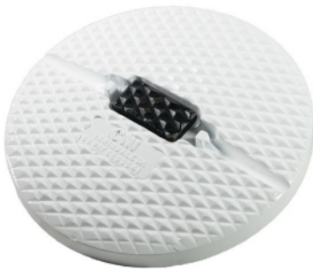
White STP200-W WHITE COLOR SNAP-TIGHT COVER