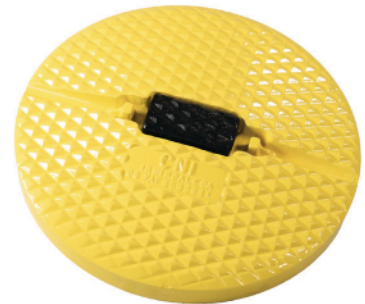
Yellow STP200-Y YELLOW COLOR SNAP-TIGHT COVER